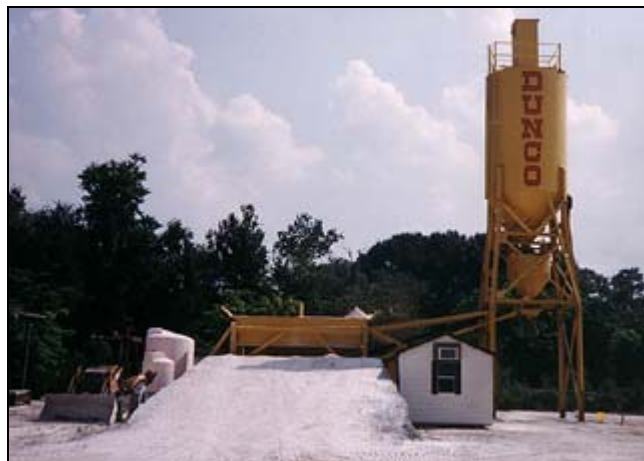
DC Colt Decumulating Plant

The standard Stephens DC-Colt can be delivered in one load of freight. The plant is standard with 375 BBL silo (other sizes are available) and a 30" transfer conveyor. The plant is completely pre-plumbed and pre-wired with water meter and air compressor. The Stephens Colt is a low profile decumulating batch plant with a charging height of 12'3". The cement silo and batcher are both round and discharge by gravity. A flyash silo can be easily added.